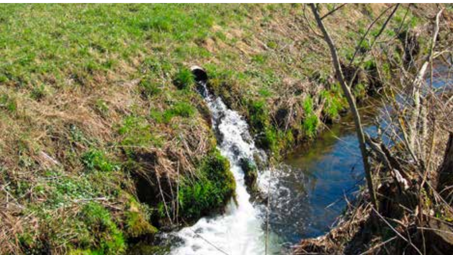
Drainage pipe discharging into a watercourse.

https://doi.org/10.34776/afs11-115 Publication date: 15 June 2020